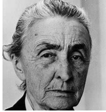
Artist - Georgia O'Keefe