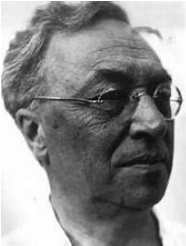
Artist - Kandinski

Identify what they might change in their current work or develop in their future work.